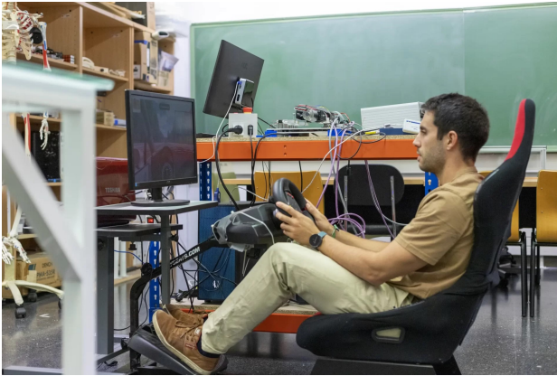
FIGURE 1. Cyber-physical bench for testing electric motors in a driving simulation.

In this work, a CPTB for low-power electric motors [2] was used as assessment platform to identify and measure the impact of different sources of error in cyber-physical experiments. This test bench mounts two motors in a back-to-back configuration: motor 1 is the device under test (DUT), to which motor 2 transmits the load evaluated by the computer simulation of its environment. The bench can be connected to a digital twin of the DUT and to a human-in-the-loop simulator to reproduce driving maneuvers, as shown in Fig. 1.